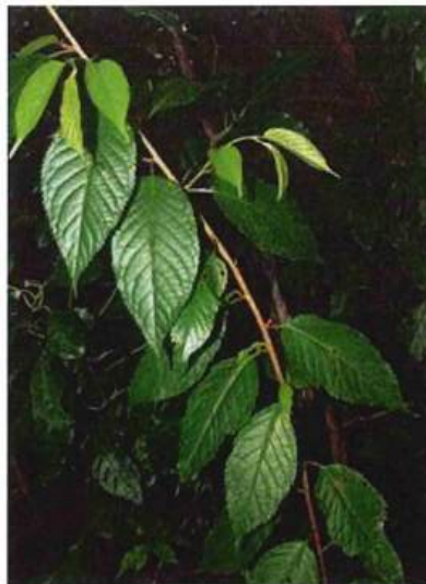
I really recommend this site for understanding or recognizing weed species.

And a heads-up. Our Trust will be starting our Autumn ship rat control using Pindone in May. Look out for the warning signage if you intend visiting for a walk but we will be also sending notifications to neighbours etc. as is required in these operations.