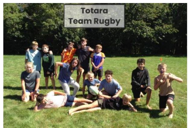
Totara Team Rugby