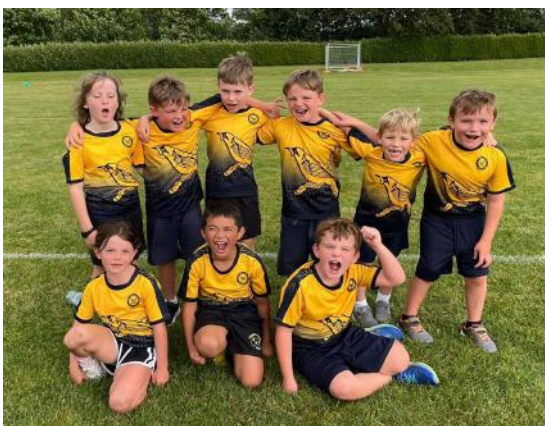
Kaharoa Tornados Touch Team

Kaharoa team sports has got off to a great start this year. We hope you enjoy these photos of a couple of our teams!