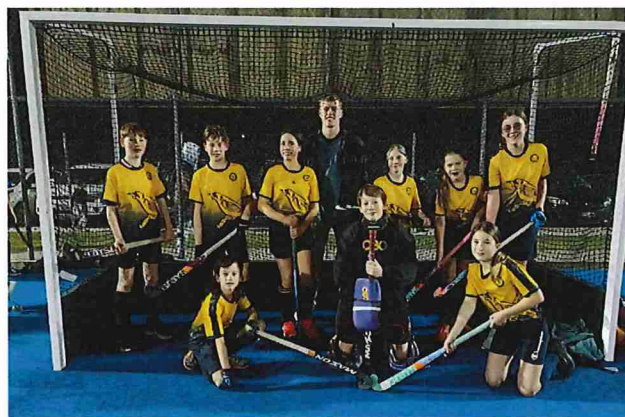
Kwik Sticks - Kaharoa Gold Team - Year 7/8