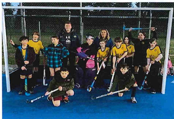
Kwik Sticks - Kaharoa Blue Team - Year 7/8

They showed great team spirit with players always willing to make up numbers in the other team when needed. Congratulations to The Kaharoa Gold Team which placed Runner-Up in this year's B Grade.